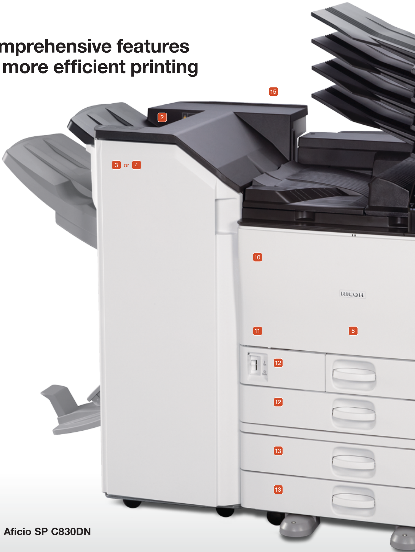
Ricoh Aficio SP C830DN