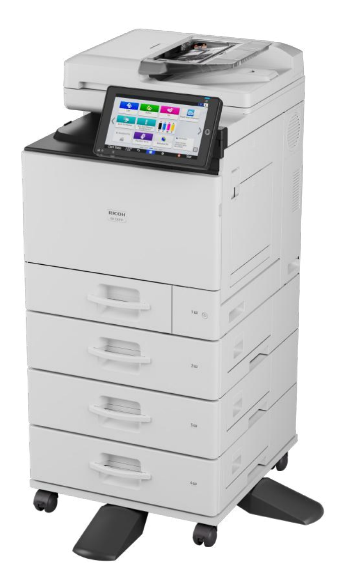
*EPEAT is only applicable in the USA.

Ricoh MFPs are designed to be Eco-friendly and energy efficient. Committed to sustainability using 10% post-consumer recycled plastic in the mainframe. We also have a deep commitment to minimizing the environmental impact of our devices and workflow, which is why we continually work to meet the global standards for energy and resource efficiency, as defined by EPEAT®* and ENERGY STAR®. Ricoh devices have low energy consumption levels, in both Typical Electricity Consumption (TEC) and actual power consumption.